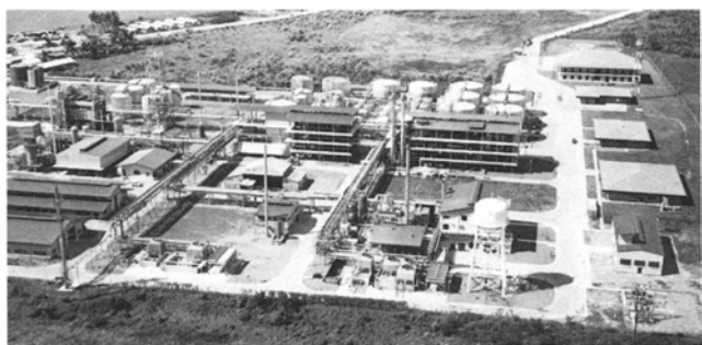
United Coconut Chemicals' new coco-chemical complex in the Philippines.

Turnkey contractor for the project has been Lurgi GmbH of Frankfurt, West Germany, and prime sub-contractor is AG&P, Manila, the Philippines.